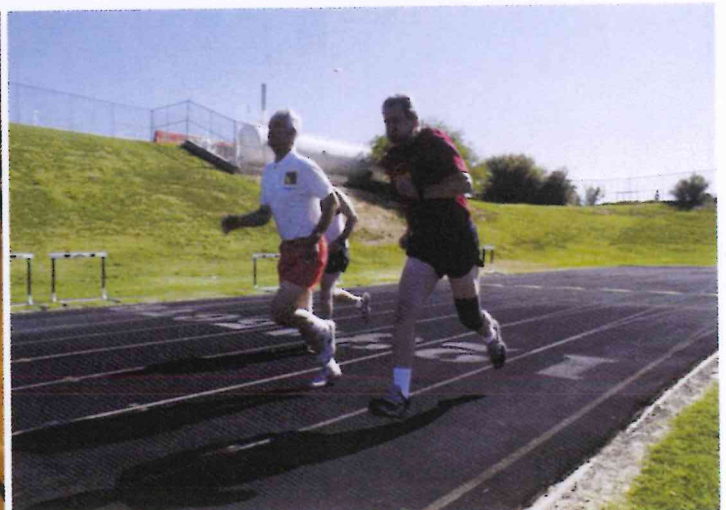
Track and Field