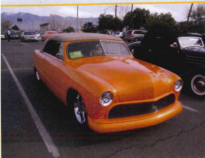
"People's Choice" 1949 Ford Convertible