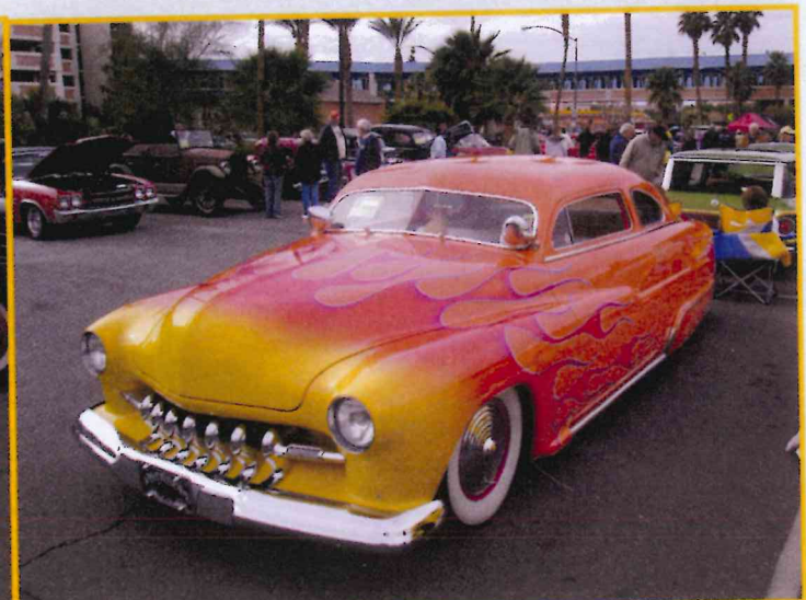
"Hottest Flames" 1951 Mercury 2 Door