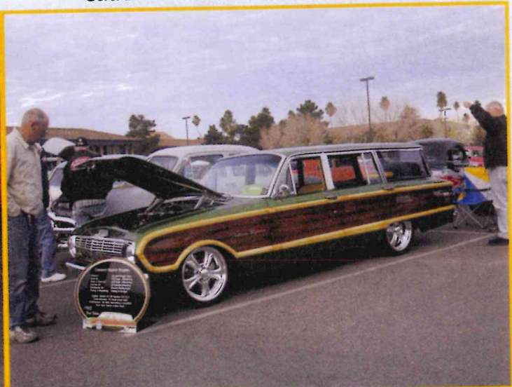
"Best of Show" 1963 Falcon Wagon