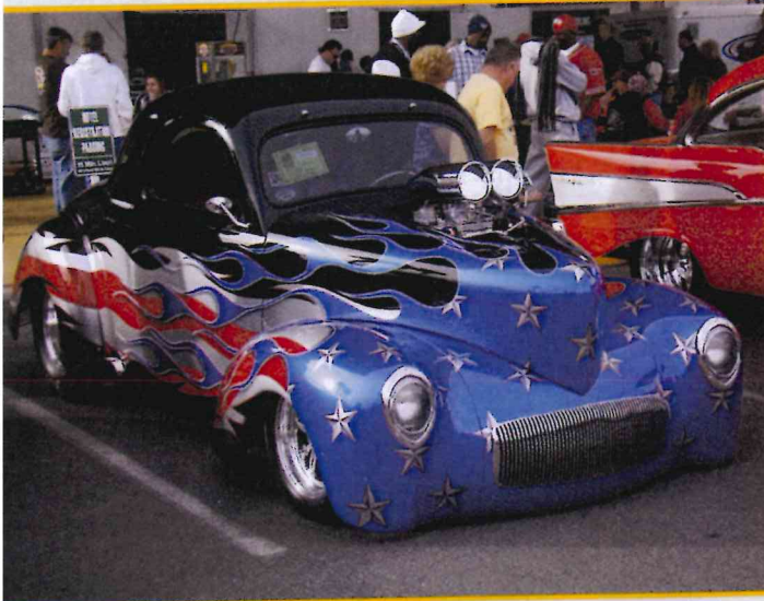
"Participants Pick" 1941 Willy's Coupe